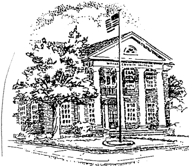
Cultural History of Central Eastern North Carolina

The Museum congratulates and thanks these award winners for all their work to preserve Wayne County's past.